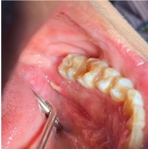
Fig. 1 Exposed bone at the lingual part of the mandible

A 58-year-old female was referred from private dental practice complaining of a painful ulcer associated with sharp bone at the lower left lingual mucosa (Fig. 1). The ulcer developed ten days after her lower left wisdom tooth was extracted. She claimed that the extraction was uncomplicated, and they faced no difficulty. The painful ulcer was also associated with an ulcer at the lateral border of the left tongue. The systematic medical review revealed neither she is suffering from any medical illnesses including radio chemotherapy nor taking any medication. She does not smoke or consume alcohol.