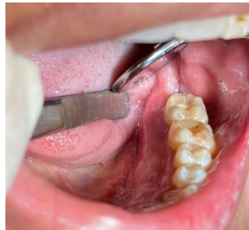
Fig. 3 Complete healing after 2 weeks post-surgery.

At one week's follow-up, the patient reported a considerable reduction in discomfort, and the presence of granulation tissue at the location of bone exposure was identified (Fig. 3). No additional therapy is necessary.