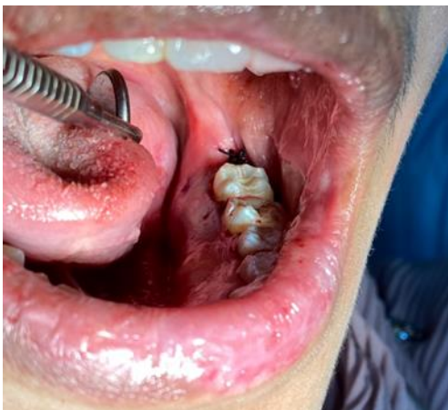
Fig. 2 Post-surgical removal of bone sequestration.

Intraoral clinical examination revealed that the lower left third molar (38) was absent. The extraction wound socket was healing fine. There was an exposed mucosal ulceration and a tiny white cortical bone ledge, approximately 2mm x 5mm in length at the lingual to 38 region, above the mylohyoid ridge. It was sharp, rough, immobile, and tender to touch. The surrounding lingual mucosa appeared reddish (erythematous) and inflamed. No discharge or active bleeding was noted. An area of halo ulceration was also present at the lateral border of the adjacent tongue at the same level with the exposed bone. No extraoral abnormalities detected.