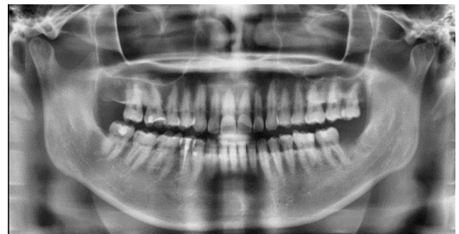
Fig. 4 Dental panoramic tomography (DPT) showed no significant findings at the area of 38.

Dental panoramic tomography (DPT) showed no abnormalities detected as shown in Fig. 4. Cone beam computed tomography (CBCT) scan revealed the presence of tiny bony portion dissociated from the lingual cortical bone in the area of 38 (Fig. 5). There was no other significant finding noticed.