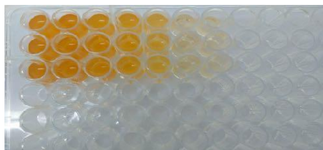
Fig. 2 MIC was done in 96 -well multiplate

The Minimal inhibition concentration (MIC) was done first before proceeding with the Minimum Bactericidal Concentration (MBC). MIC is the lowest concentration of an antimicrobial agent that can inhibit the visible growth of the microorganism after an incubation of 18 hours. It was used to evaluate the efficacy of antibacterial used in this experiment. The multi-plate 96 – well was placed in the multi- plate reader to obtain the results. The lowest value of the MIC was selected and plated onto the agar plate. The MBC was carried after the lowest MIC was determined. Several serial dilutions were done before plating the sample onto the agar plate. Ten microliter from serial dilution was transferred from the tube to the BHI agar and incubated for 18 hours at 37^{\circ}\text{C} . The appeared colonies on the BHI agar plate were counted and the CFU/ml was calculated.