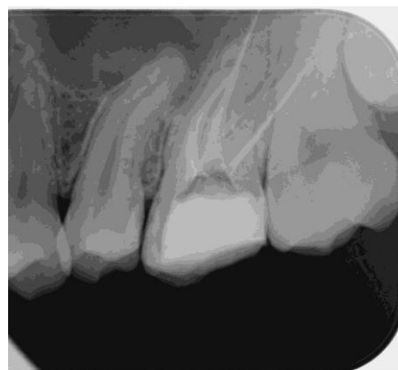
Fig 3: Post obturation radiograph.

The semi-permanent filling was placed with composite ( Filtek Z350, 3M ESPE, Minnesota ). The patient was referred back for cuspal coverage, where a recall appointment after six months was made to monitor healing progression.