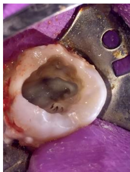
Figure 1: Access opening performed after pre endodontic composite build-up, where three canal orifices noted at the mesiobuccal root.

The tooth was anaesthetized with 2.2ml 3% mepivacaine containing 1:100 000 adrenaline ( Scandonest, Lancaster, United Kingdom ), rubber dam isolation was applied ( Blossom, Union City ). Caries was removed, and endodontic access was created, as shown in Figure 1.