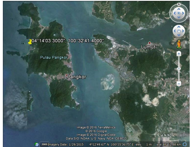
Fig. 1 The collection site of morphospecies Holothuria ( Mertensiothuria ) leucospilota in Teluk Nipah Beach, Pangkor Archipelago, Perak, Malaysia (4°14' 03.3"N 100°32' 41.4"E) highlighted with the yellow mark. Adapted from [7]

A specimen of morphospecies Holothuria ( Mertensiothuria ) leucospilota was collected from Teluk Nipah Beach, Pangkor Archipelago, Perak, Malaysia (Global Positioning System (GPS) position - 4° 14' 03.3"N 100° 32' 41.4"E, Fig. 1)). The sampling was done during the low tide (0817 dated 2<sup>nd</sup> March 2016). The specimen was labelled HL1 (Fig. 2).