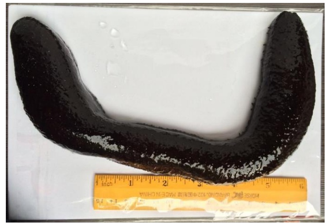
Fig. 2 Specimen of Holothuria (Mertensiothuria) leucospilota or white threads fish from Teluk Nipah Beach, Pangkor Archipelago, Perak, Malaysia

Species identification of the specimen was done prior to microbial isolation from various parts of its body. Approximately 2 cm<sup>2</sup> tissue portion of the specimen was cut and preserved in 70% ethanol prior to the transportation by ferry and then by car to the Science Research Lab 3.2 (SRL 3.2), Faculty of Science and Technology (FST), Universiti Sains Islam Malaysia (USIM), Nilai, Negeri Sembilan, Malaysia. The tissue sample was stored in -20°C chest freezer in the SRL 3.2 for long-term storage with proper cataloging.